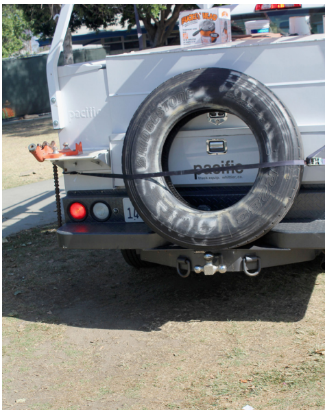
Just too tired: Allegedly, the senior class pulled a prank on the school and left tires on rooftops, light poles and scattered around campus. Groundsmen went around picking them up.